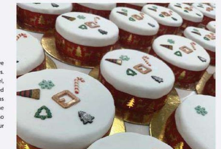
Sustainability Report - 2023

In the spirit of giving and coming together during this festive season, we are delighted to share a heartwarming initiative from our hotels in Paphos. With the collective effort of our talented pastry cooks at Cypria Maris Hotel, we raised funds for Christmas cakes, and our dedicated pastry team worked together to create them. All funds collected will go to the Margaritas Foundation, supporting their impactful charitable work. This extends the joy to those in need. We express our sincere gratitude to everyone who participated and contributed to making this initiative a success. Your generosity truly embodies the spirit of the season.